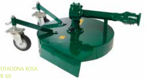
ROTACIONA KOSA RK-60 Širina košnje: 60 cm

FINGERMÄHBALKEN UNIVERSALMÄHBALKEN KOMMUNALMÄHBALKEN