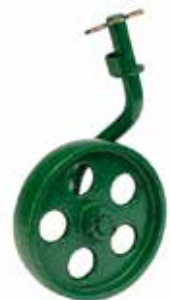
KOTAČIĆ ZA PRIJEVOZ KOPAČICE