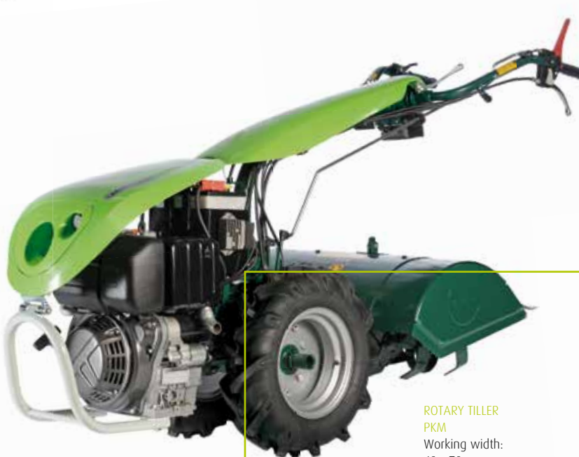
ROTARY TILLER PKM Working width: 40 - 70 cm