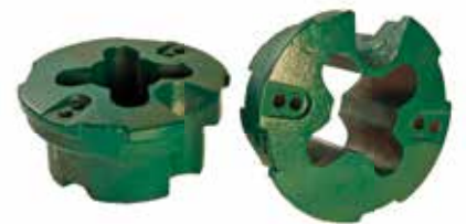
UTEZI ZA KOTAČE T-15 Težina: 17 kg